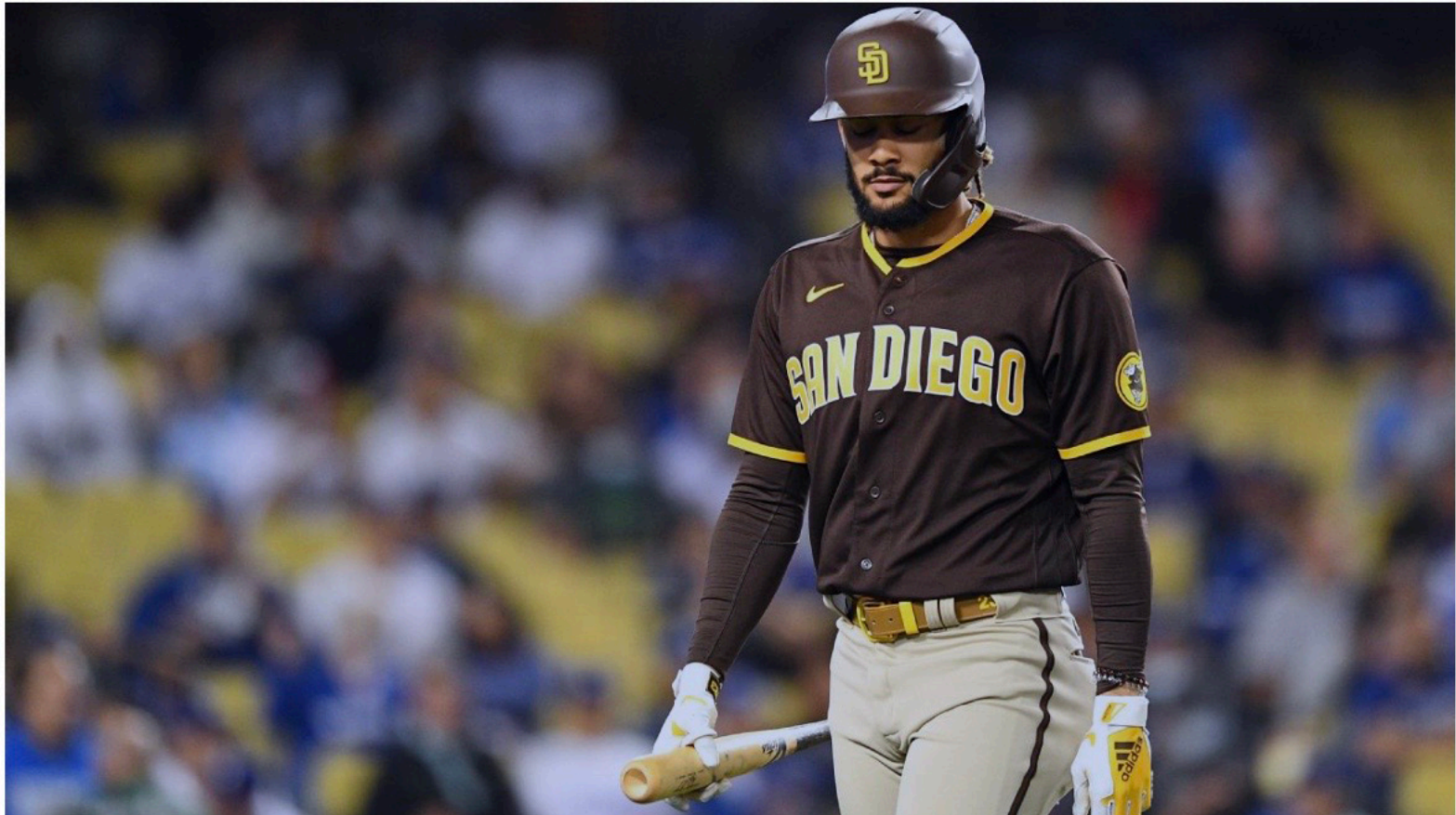
Padres Shortstop, Fernando Tatis Jr, tested positive for Clostebol, a performance enhancing drug.

On August 12th the San Diego Padres Shortstop, Fernando Tatis Jr, tested positive for Performance enhancing drugs. The news came as a shock as he was just about to return to the Padres and perform for the rest of the season. What kind of repercussions could this have on the Padres defense? While they are sitting a good sized lead in the NL west, this could always change although chances are, the Padres will most definitely pick up a wild card spot in the postseason. Whether or not they will advance to the NLDS or beyond remains to be seen. Another question comes to mind and that is, what will the Padres do with Tatis? Can they hold onto him or will they release him as a free agent? So many possibilities remain to be seen but all we can hope or is that the Padres can recover from this smoothly.